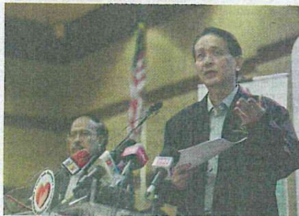
On the ball: Dr Noor Hisham speaking at a daily press conference.

of reported cases, Dr Noor Hisham explained that information on new cases was based on the numbers as at noon daily.