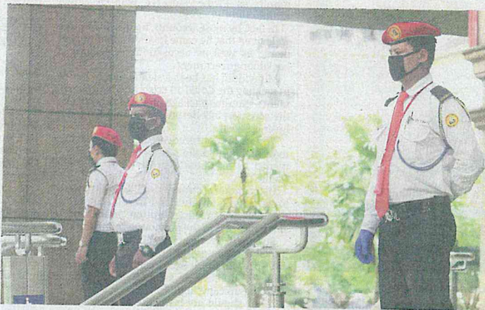
Safety first: Security personnel wearing masks while on duty.

Dr Noor Hisham was asked if the ministry would recommend the use of non-surgical face masks following the recommendation made by the US Centres for Disease Control