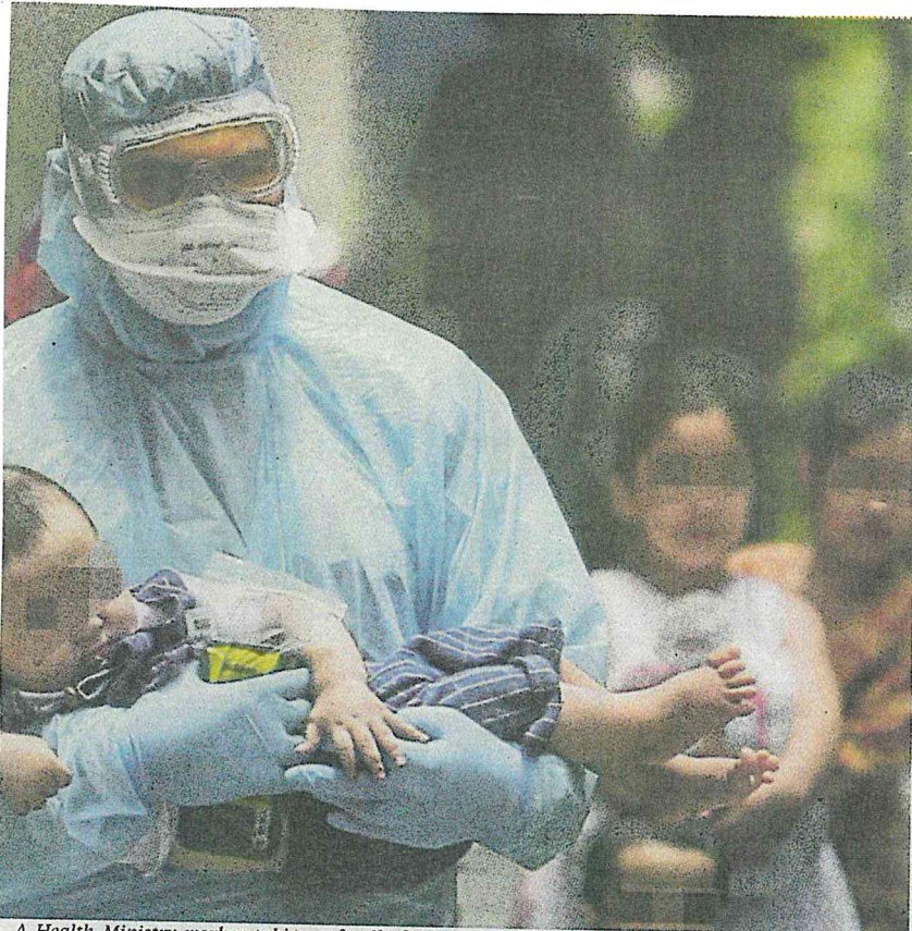
A Health Ministry worker taking a family from Menara City One, Kuala Lumpur, to Kuala Lumpur Hospital yesterday.