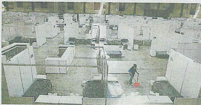
The interior of the makeshift hospital at Malaysia Agro Exposition Park Serdang.

ditioned and each patient will be provided a single bed with two pillows, a drawer and a small study table for them to store belongings.