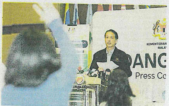
Health director-general Datuk Dr Noor Hisham Abdullah fielding questions in Putrajaya yesterday.

A total 88 Covid-19 patients recovered and were discharged yesterday, bringing the tally to 915 or 26.27 per cent of the positive cases recorded.