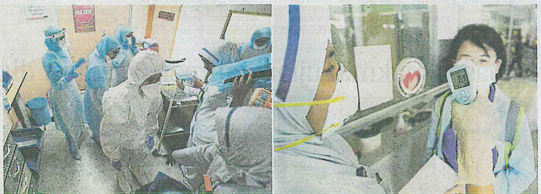
Petugas hospital terus berusaha menunaikan tanggungjawab dalam menangani penularan COVID-19 yang melanda negara ketika ini.

"Beliau dirawat di Institut Jantung Negara pada 23 Mac lalu dan