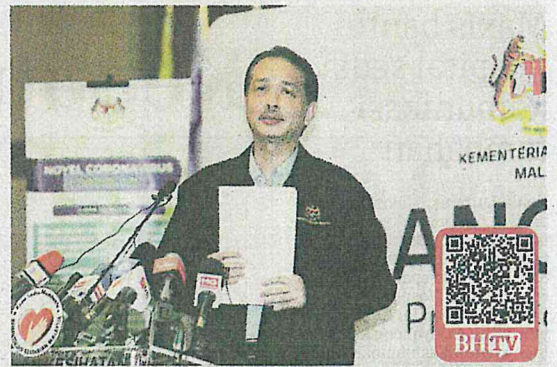
Dr Noor Hisham pada sidang media situasi semasa jangkitan COVID-19 di Putrajaya, semalam.

Kita kena kawal risiko kes import ini bagi mengelak ramalan peningkatan kes menjelang pertengahan bulan ini tidak menjadi kenyataan.